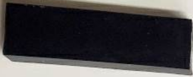
4" x 3/8" Rubber Pad