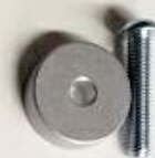
6x30mm Button Head Bolt