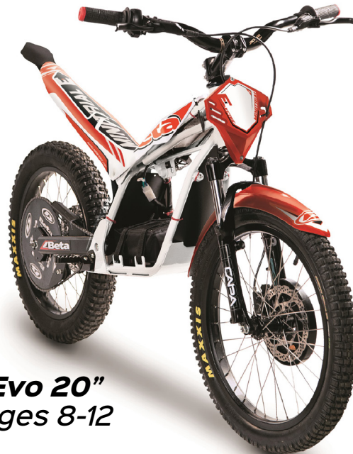
Evo 20" Ages 8-12