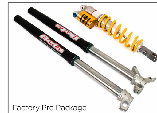
Factory Pro Package