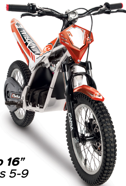
Evo 16" Ages 5-9