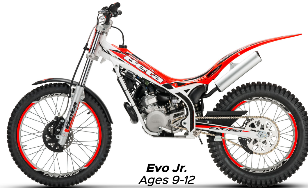
Evo Jr. Ages 9-12

The Beta Evo Jr. and Sr. models are the perfect starter bike for kids riding trials. These super reliable models offer a stable platform that youth riders can develop their riding skills on without being intimidated.