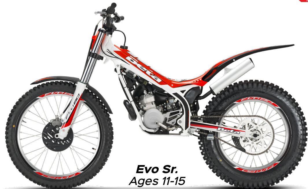
Evo Sr. Ages 11-15